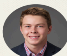
Ryan Dix Healthcare