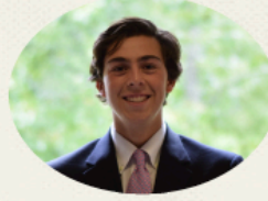
Jackson Cook Industrials