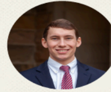
Michael Barry Real Estate