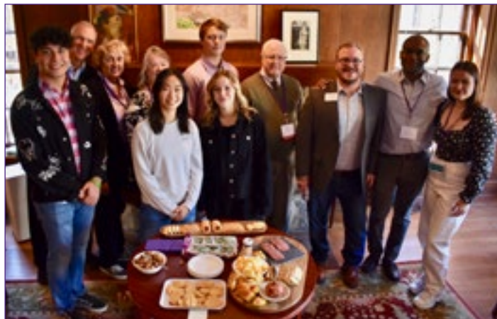
Alumni, students, and OGC staff at the Homecoming '22 reception

Sewanee offers over 120 programs on all seven continents! Top destinations for Advent '23: Ecuador, Italy, France, New Zealand, and Spain.