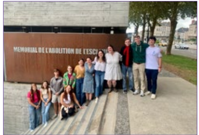
Students studying abroad in Nantes visit the Memorial to the Abolition of Slavery